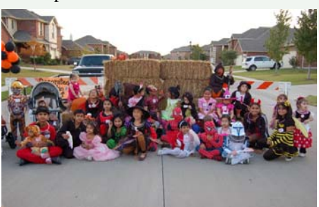
Check out the website for more pictures