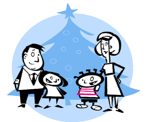
The Social Committee could use some new ideas, input and resources. Please consider attending a meeting to help out!

Come meet your neighbors, check out the activities and enjoy! The Festival of Lights winners will also be announced!