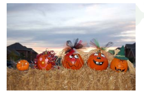
Decorated Pumpkin Contest