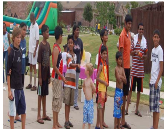
The never ending line for the dunk tank at the Block Party on June 12th, 2010

Texas National Night Out is Tuesday, October 5th. So, at or around 7 pm turn on your porch light, go outside, enjoy the cooler weather and meet some of your neighbors!