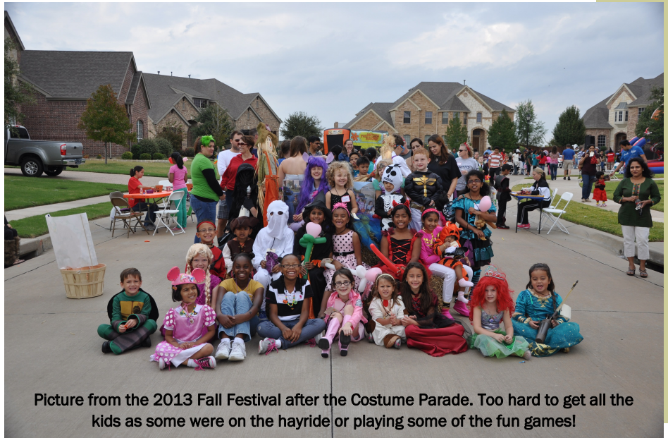
Picture from the 2013 Fall Festival after the Costume Parade. Too hard to get all the kids as some were on the hayride or playing some of the fun games!